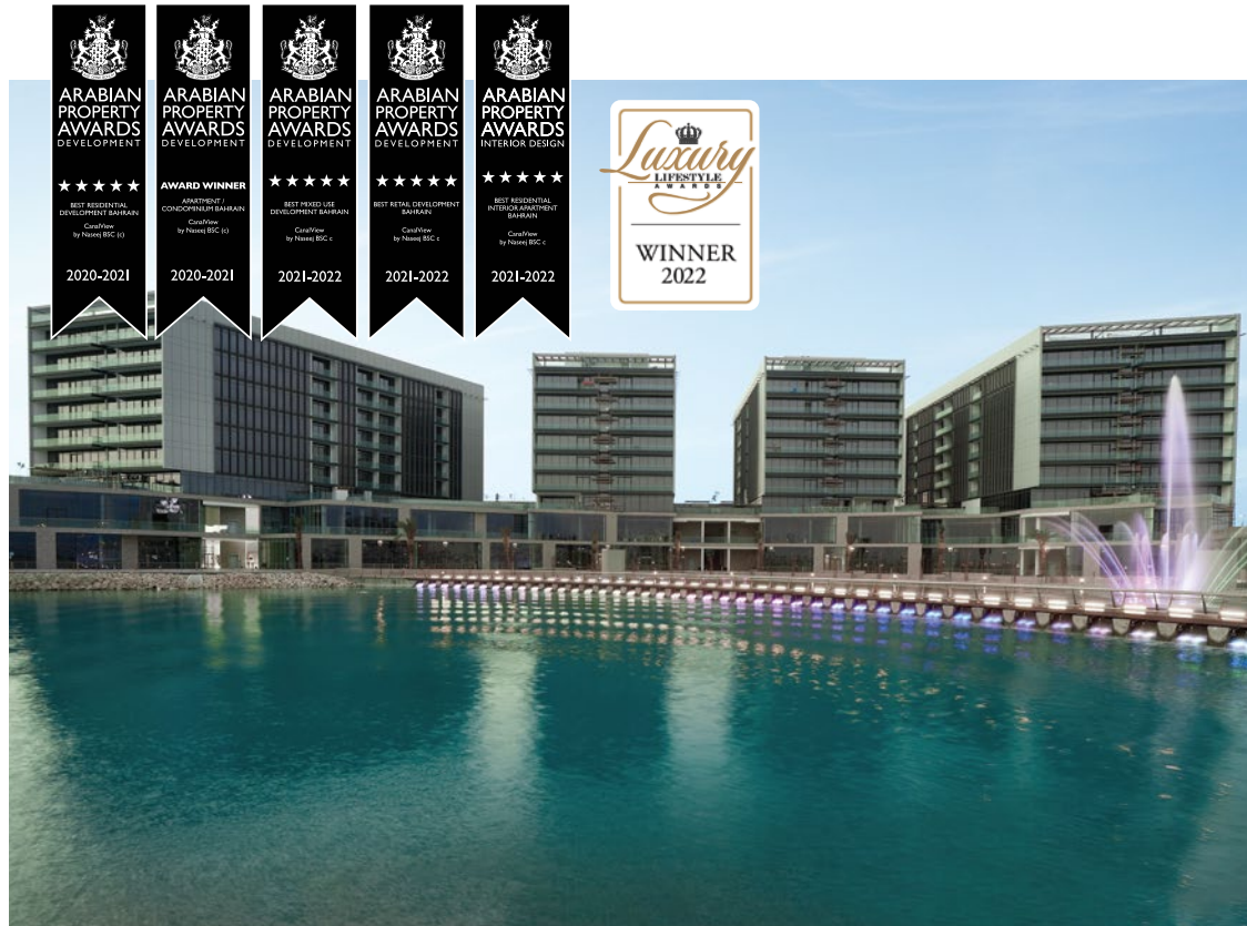
CanalView at Dilmunia