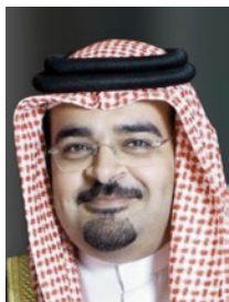
SHAIKH HAMED MOHAMED ALKHALIFA