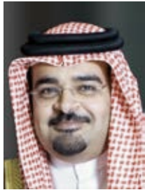
SHAIKH HAMED MOHAMED ALKHALIFA