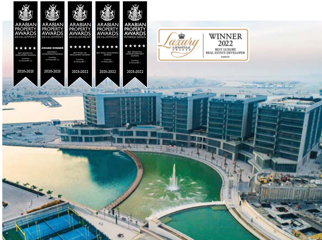
CanalView at Dilmunia